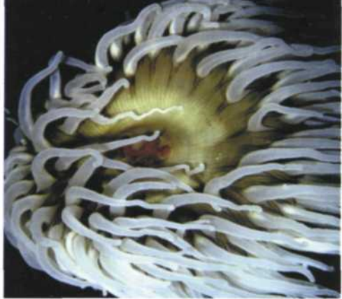
NOTICEABLE IMPROVEMENT An underexposed shot of an anemone (top) is tranformed into a vibrant underwater image by using Adobe Elements' levels editor and brightness controls.

especially with a cost of less than $100. The features lend themselves well to both scanned images and those taken with digital cameras.